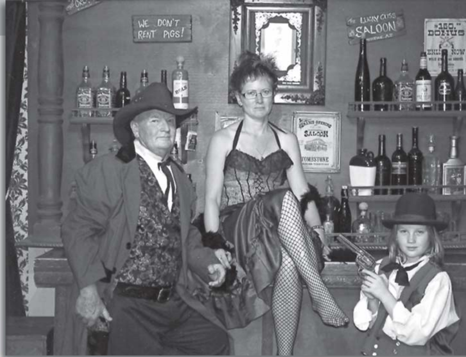
The Editor and production team caught on camera in Tombstone, Arizona, U.S.A.

And finally after much encouragement from our stockists we have redone our liqueurs, upgraded flavours where possible, new labels and importantly an extension to the range of syrups, powders and creamers.